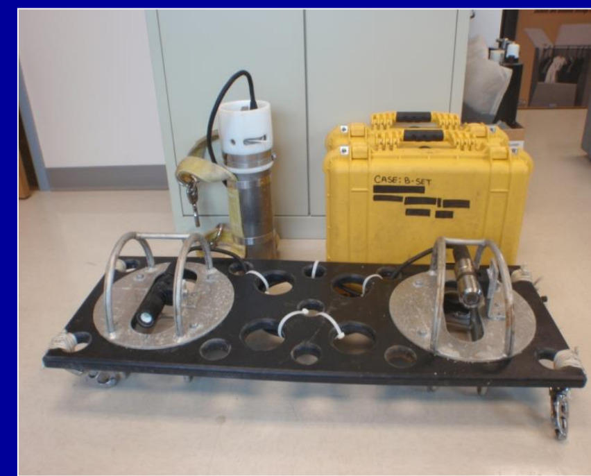
Custom designed systems

We provide loaner video camera systems to fishermen to support their evaluation of industry-designed approaches to reduce bycatch and reduce impacts to benthic habitats. Loaner camera systems greatly facilitate science and industry collaborations.