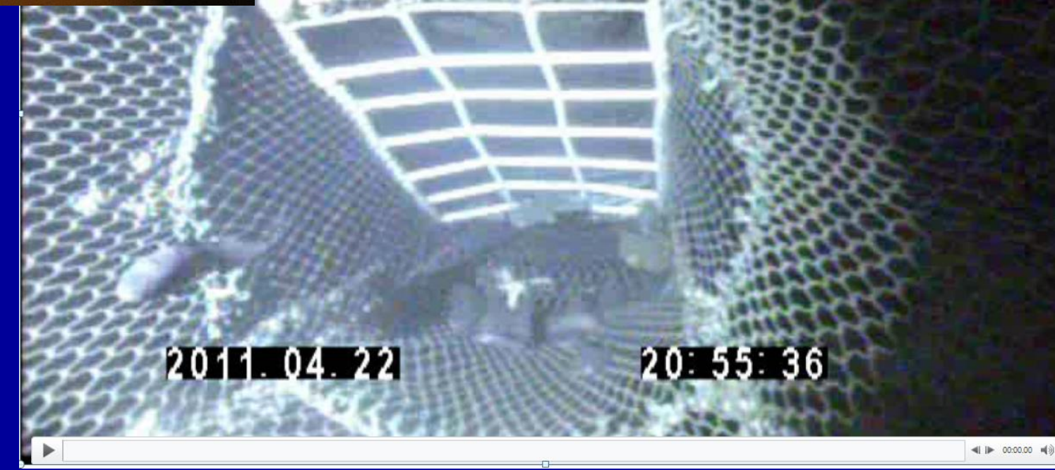
F/V Last Straw Foulweather Trawl Excluder

Frame grab from loaner video system (April 2011) aboard the F/V Last Straw during fishermen's evaluation of an industry-designed horizontal flexible grid halibut excluder.