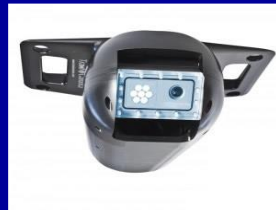
TrawlCam system, JT Electronics

http://www.nwfsc.noaa.gov/research/divisions/fram/groundfish/habitat.cfm